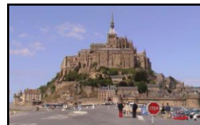
Mont St. Michel